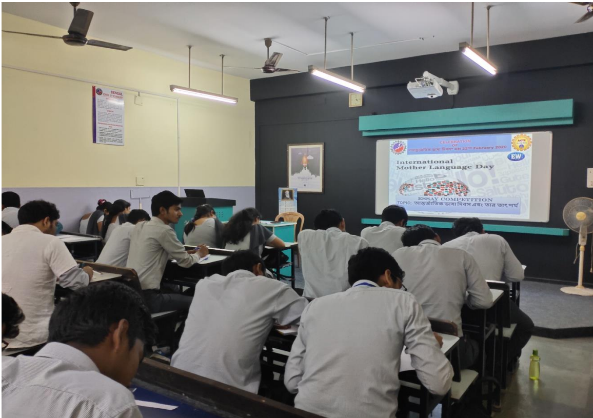
CELEBRATION OF THE INTERNATIONAL MOTHER LANGUAGE DAY