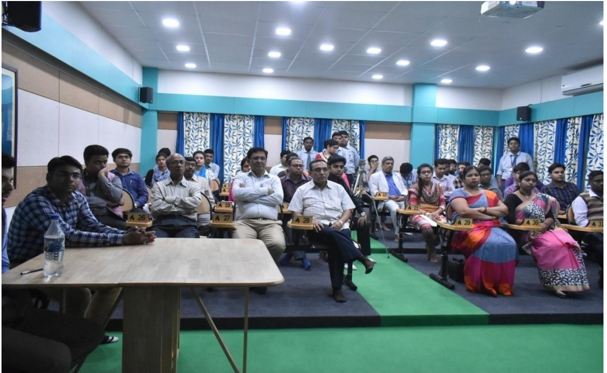
CELEBRATION OF THE INDIAN CONSTITUTION DAY